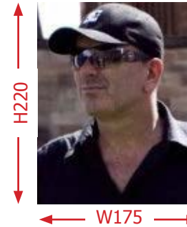
DIRECTOR HEADSHOT W175 x H220