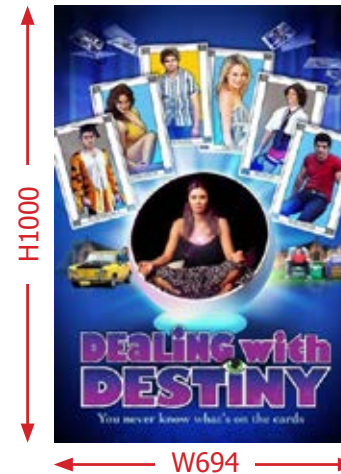
MOVIE POSTER W694 x H1000

A movie poster is not required for Planet Blue Pictures but you will need one if your film is accepted to platforms like Hulu and iTunes.