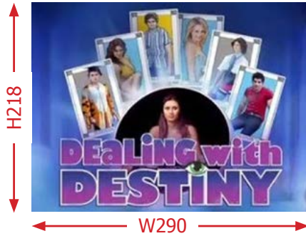
THUMBNAIL W290 x H218